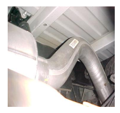
Install the over axle tailpipe # C into the muffler 1-1/2" to 2". Secure to the muffler using clamp # F. Do not tighten.

Lay out the exhaust on the floor so it looks like the drawing and compare parts with manual. To remove the stock exhaust, remove it from the clamp in front of the muffler. You may need to heat it up for easier removal. Leave all rubber grommets in place. Use WD-40 to aid in removal of exhaust and hangers.