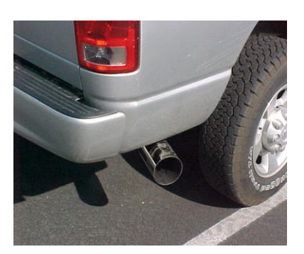
Install stainless steel tip. Clamp down. When you have everything in place, firmly tighten all bolts and clamp down securely. To clean stainless steel tip use any stainless steel cleaner.

MAKE SURE YOU HAVE A 1" CLEARANCE ON ALL RUBBER BRAKE LINES, SHOCK BOOTS, TIRES, FUEL LINES, ETC.