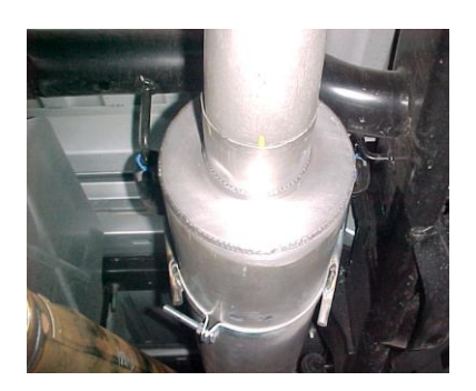
Install muffler # B onto headpipe # A 1-1/2"-2". Use clamp # F to secure to headpipe, do not tighten. Next, install band clamp # G onto muffler and insert hangers, do not tighten.

Install the turnout pipe # D on to the tailpipe. Insert welded hanger into rubber grommet. Secure together with clamp # F. Do not tighten. Roll the exit pipe until it is at the correct angle for your truck.