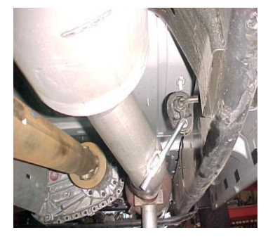
Install headpipe # A on to your existing stock front pipe and secure with clamp # F. Make sure to line up the notch. Insert welded hanger into rubber grommet. Do not tighten.