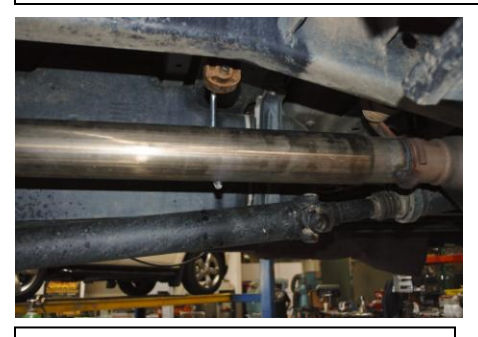
2. Install Headpipe Item #A onto the factory pipe using clamp Item#E to secure. Do not tighten.

1. Disconnect the negative battery cable before removal of the OEM Exhaust. This will allow the computer to reset and recognize the new exhaust. Lay out the exhaust on the floor so it looks like the drawing and compare parts with manual. Remove the factory exhaust by cutting behind the factory muffler. Once the tail pipe has been removed un-bolt the muffler and head pipe at the clamp located behind the factory Particulate filter. Use wd-40 or another type of penetrating oil to remove the rubber grommets. Do not damage these they will be re used.