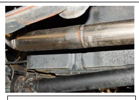
3.Install the supplied extension pipe. Use clamp Item# F to secure. Do not tighten.