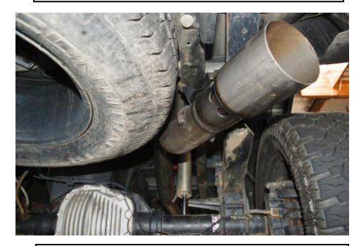
6.Be sure there is proper clearance from spare tire and shocks.