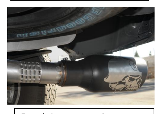
7. With proper clearance from spare tire install the exhaust tip onto the tailpipe. The system was designed to have the tip 1" below the quarter panel of the vehicle. With the tip in your desired position begin to tighten down all clamp connections from the front head pipe back

"MAKE SURE YOU HAVE A 1" CLEARANCE ON ALL PIPES FROM ALL RUBBER BRAKE LINES, SHOCK BOOTS, TIRES, ETC..." TORQUE ALL CLAMPS TO APPROX. 100 TO 150 FT LBS.