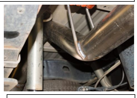
4. Install Over axlepipe Item #C onto the extension pipe. You may need to make some adjustments to find the correct location of the over axle pipe.